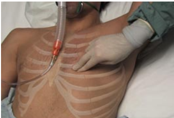
Figure 1. Locating Landmarks.

Position the patient in either a supine or a semirecumbent position. Maximally abduct the ipsilateral arm or place it behind the patient's head. The area for insertion is approximated by the fourth to fifth intercostal space in the anterior axillary line at the horizontal level of the nipple. This area corresponds to the anterior border of the latissimus dorsi, the lateral border of the pectoralis major muscle, the apex just below the axilla, and a line above the horizontal level of the nipple—often referred to as the “triangle of safety.” 2 You can isolate this area by palpating the ipsilateral clavicle, then working downward along the ribcage, counting down the rib spaces. Once the fourth to fifth intercostal space is felt, move your hand laterally toward the anterior axillary line (Fig. 1). This is the area for incision; the actual insertion site should be one intercostal space above the chest-tube incision site. Mark the spot for incision on the skin with a pen or the back of a needle.