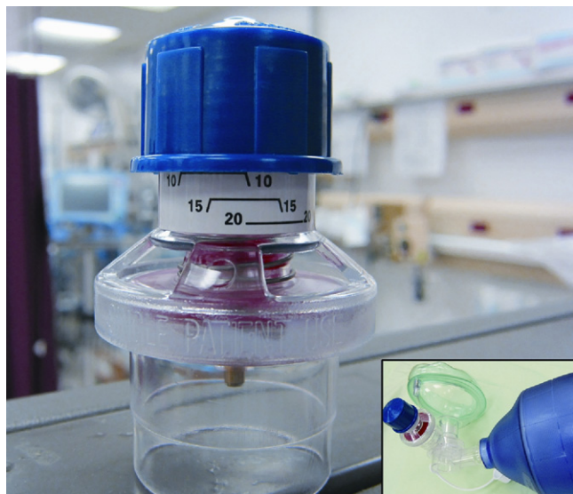
Figure 2. A disposable PEEP valve. This inexpensive item is a strain gauge capable of PEEP settings from 5 to 20 cm H 2 O. When placed on the exhalation port of a bag-valve-mask device (inset), it allows the device to provide PEEP/CPAP when the patient is spontaneously breathing and during assisted ventilations. If combined with a nasal cannula set to 15 L/minute, it will provide CPAP even without ventilations. The generation of positive pressure is predicated on a tight mask seal.

effects may not be applicable to volume-depleted critically ill patients. 36